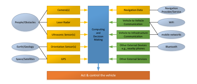
Figure 2: Abstract representation of decision making in autonomous vehicles composed from various sources (cf. [17, 23, 43, 54, 57, 59, 61])

Depending on the technology and the amount of sensors, the type and quality of information that is gathered differs. This extremely complex process might be difficult to imagine and in order to give an idea of what self-driving cars "see" we refer to the visualization shown in [58] presented by Waymo [59]. It is based on the data gathered by multiple sensors installed in the self-driving car, including a laser radar (LIDAR) mounted on the top of the vehicle. Algorithms detect patterns in the data and calculate positions and